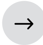
Digital goods download