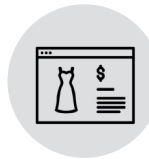
Cross-sell and upsell capabilities