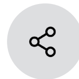
Social sharing tools