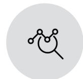
Filters for quick search results