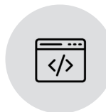
Online marketplace integration