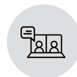
Support with live chat