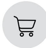
One page checkout